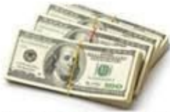
Cash especially foreign currency